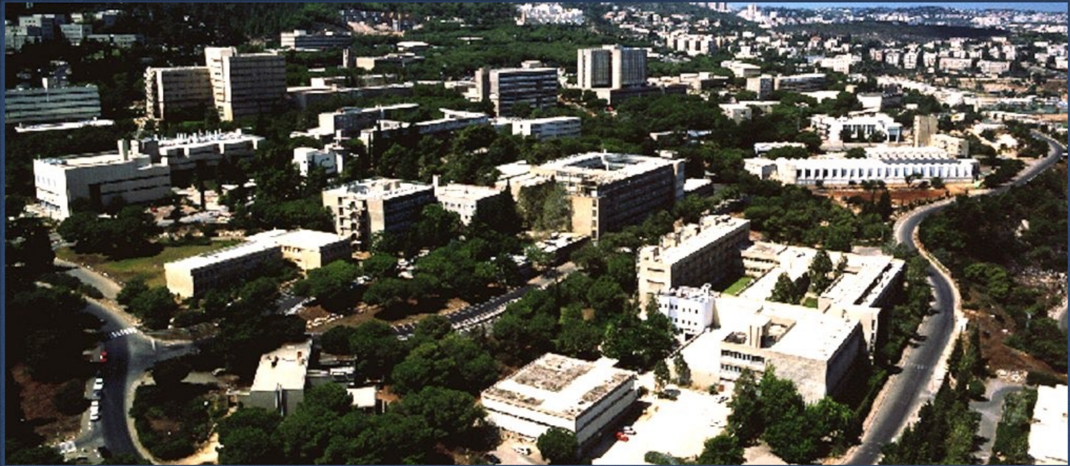
Technion, Mt. Carmel