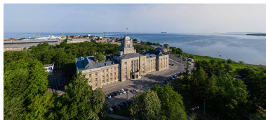
Maritime Academy (MFCS'21)