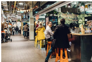
Balti Jaam market