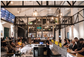
Põhjala Brewery and Tap Room