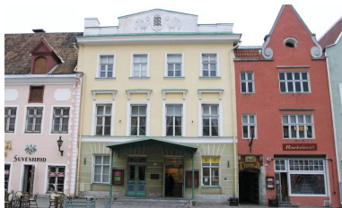
Teacher's House (PPDP/LOPSTR'21)

Many places in the city can accommodate an event like FSCD 2024, with a suitable plenary hall and a good number of smaller rooms for workshops.