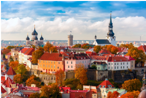
The Old Town