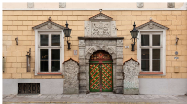
House of the Blackheads (ICFP'05, TYPES'15)