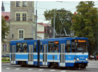
Tram number 2