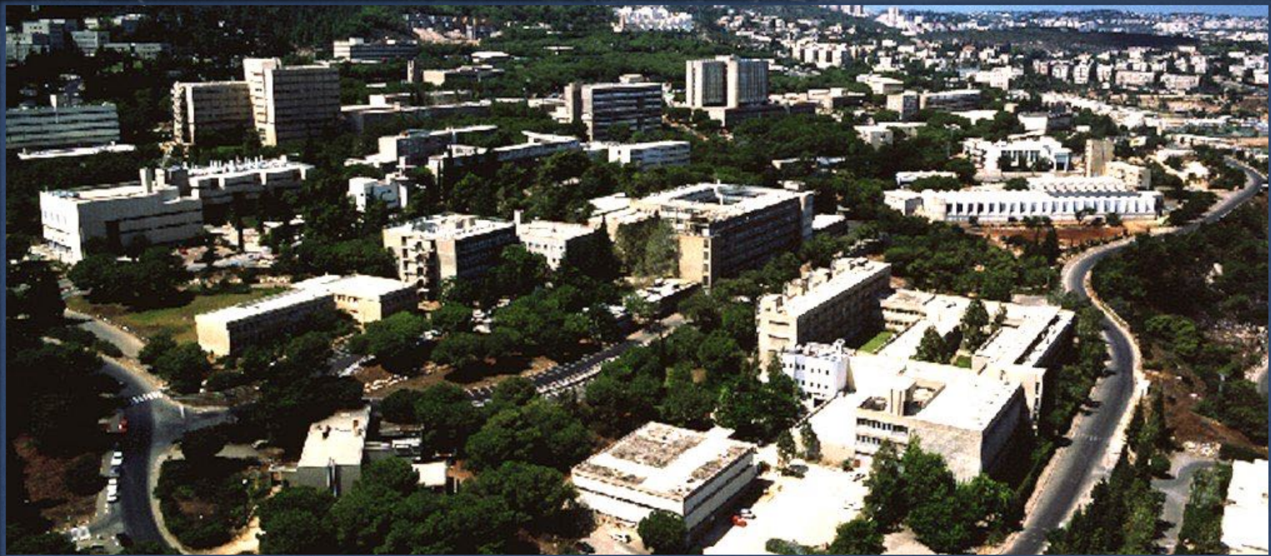
Technion, Mt. Carmel